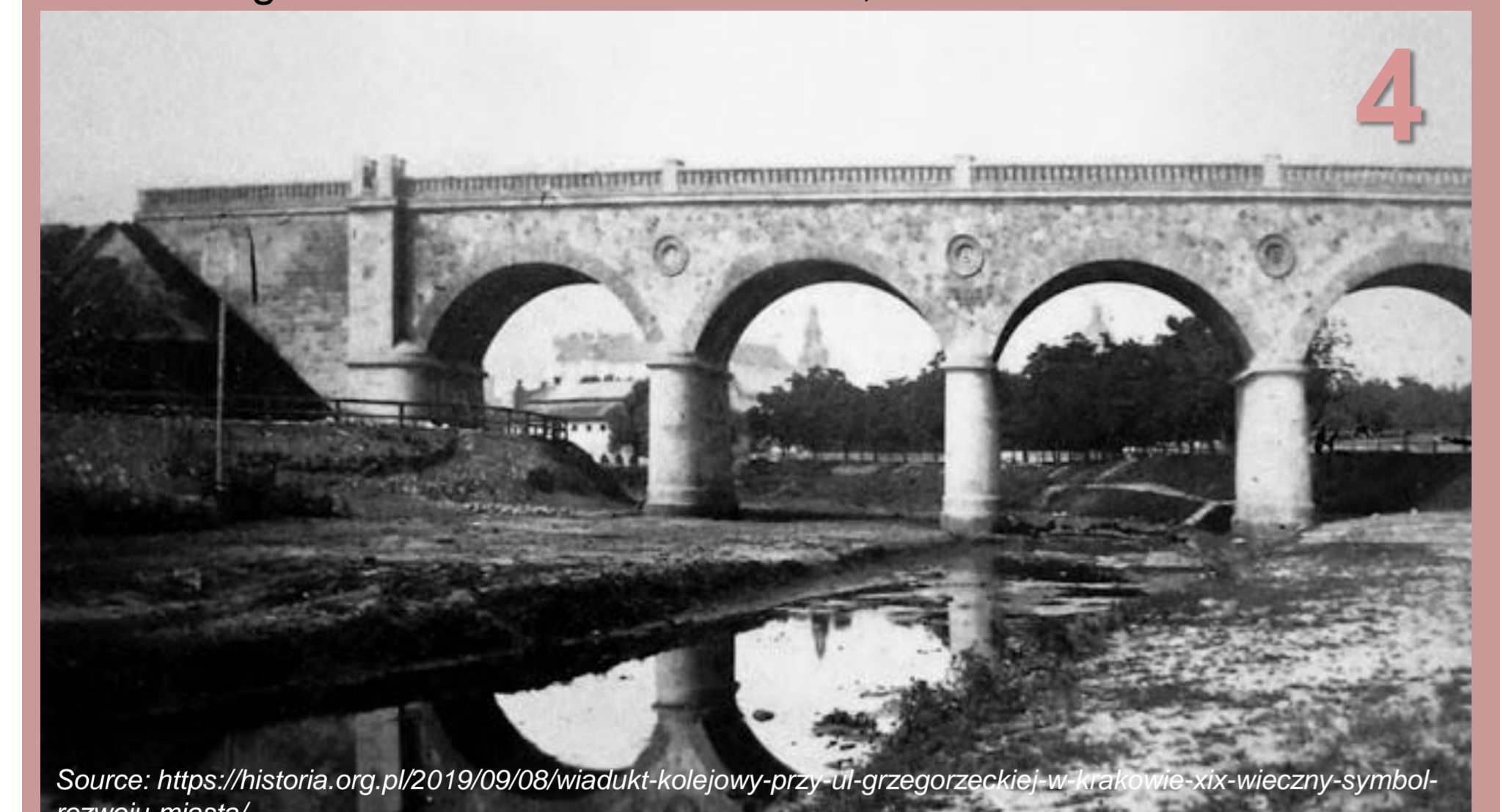
Train bridge over OLD Vistula channel, 1865.