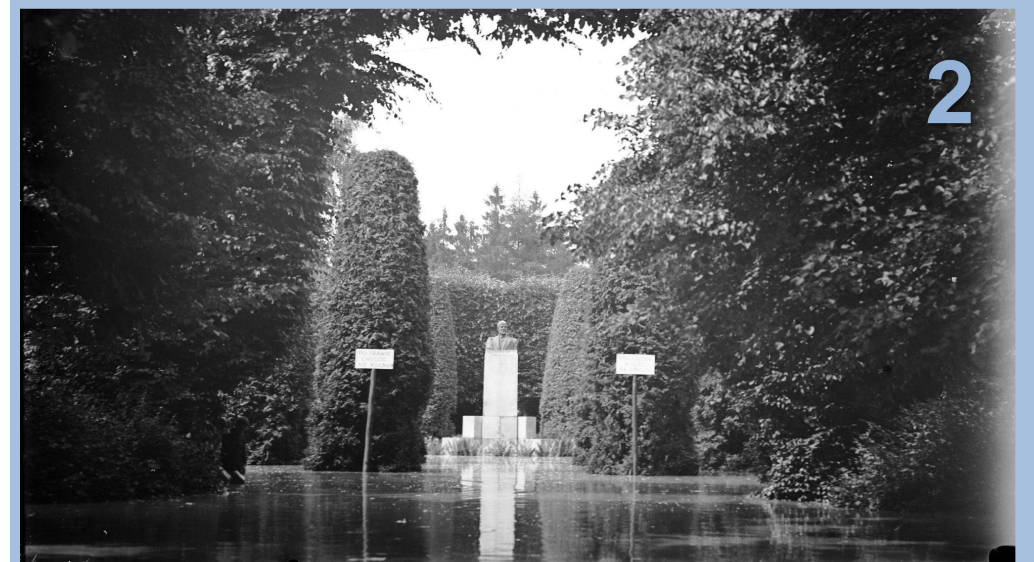
Park Jordana 1925.