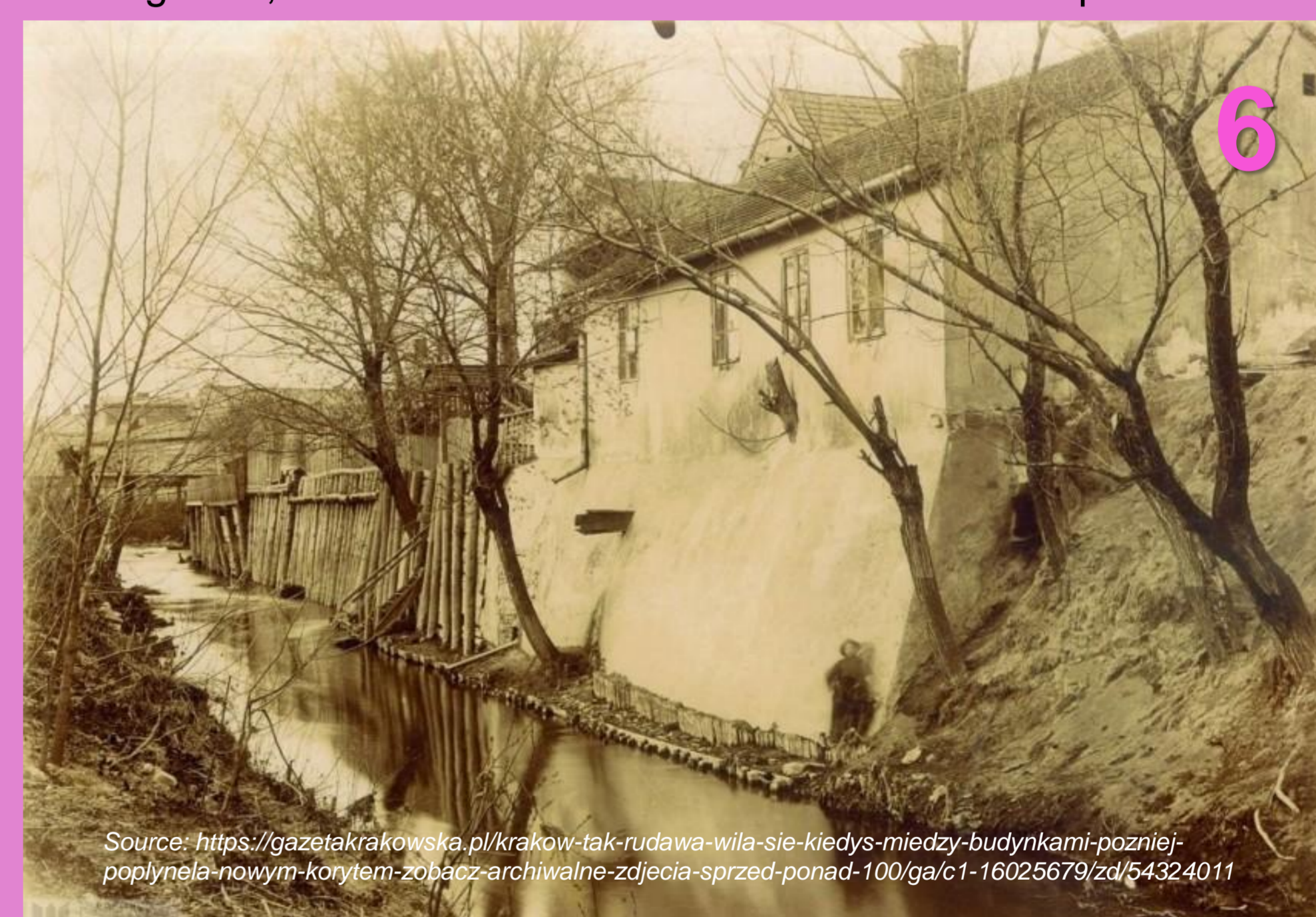
Retoryka Street in the early 20th century, with the Rudawa River flowing here, on the section between ul. Smolensk and pl. Kossak.