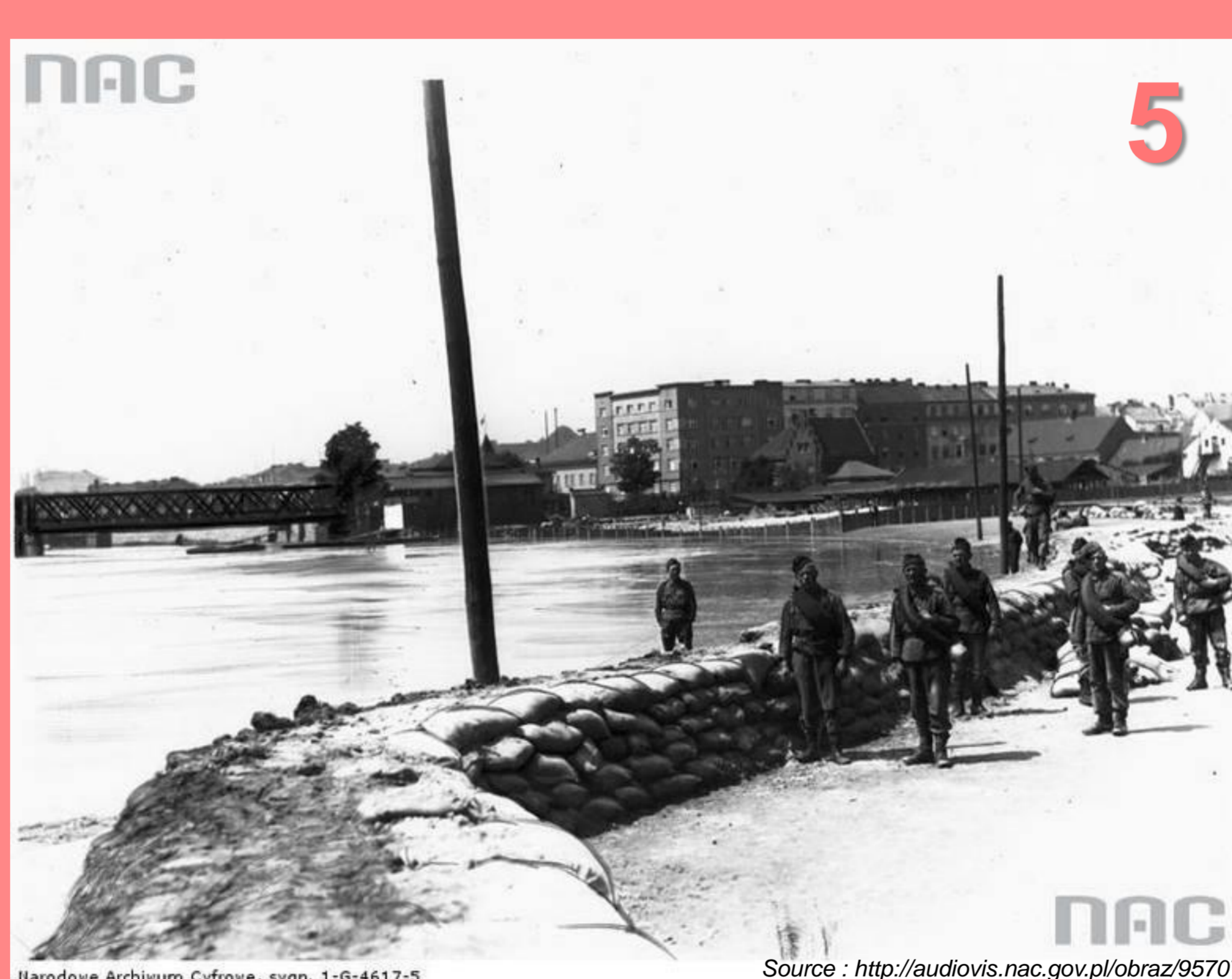
Sappers are building a protective embankment of sandbags on Plac na Groblach